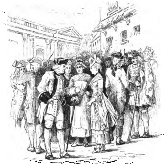
'Groups of people, of all ranks, talking of Sir Ulick O'Shane's bankruptcy.'

his way to one of the barred windows. There was a place where notes were handed in and accepted , as they called it, by the clerks, who thus for the hour soothed and pacified the sufferers, with the hopes that this acceptance would be good, and would stand in stead at some future day. They were told,